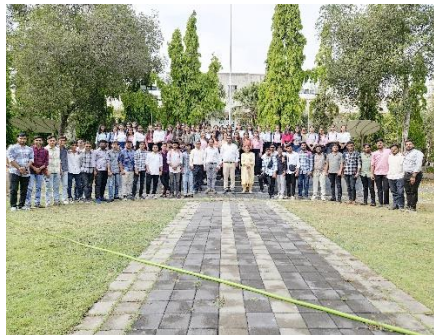
Group - Pashan