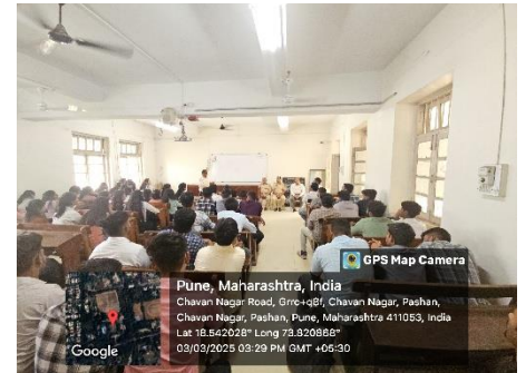
Session - WPTC