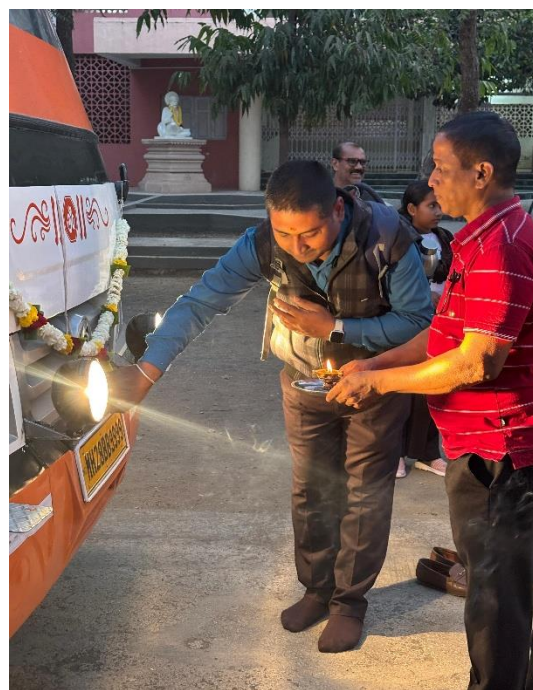
Departure from College