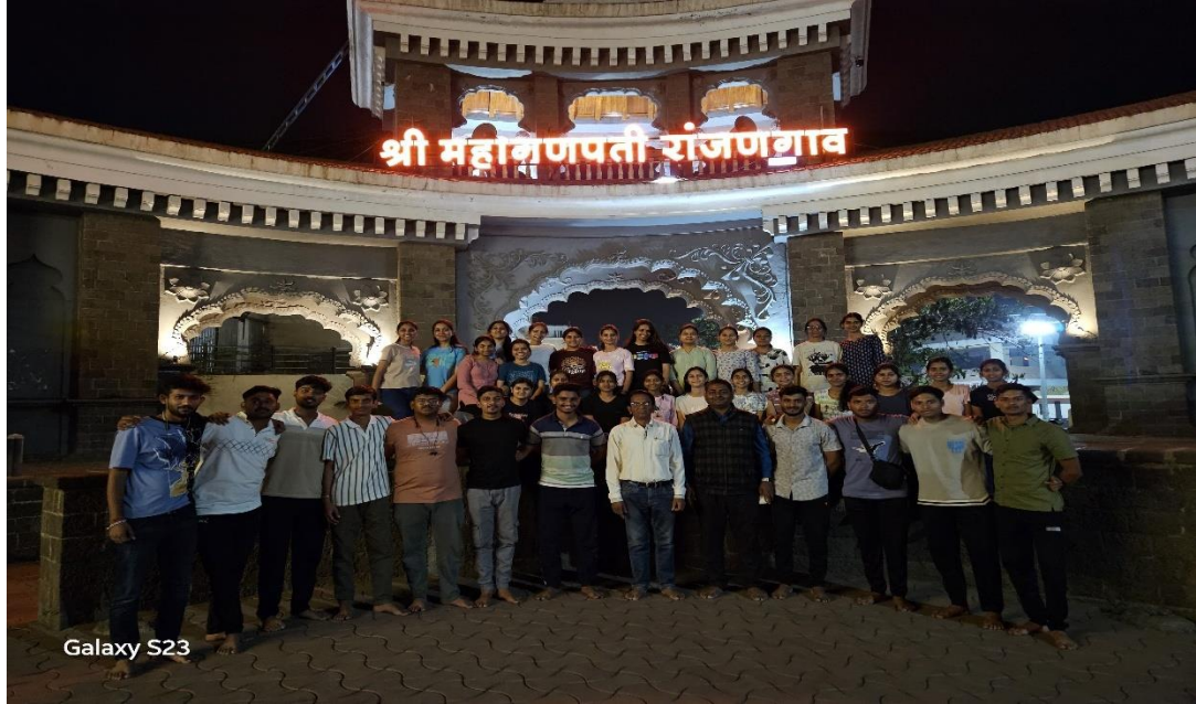
Shri Mahaganapati Ranjangaon Temple